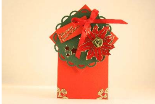
Metric Diamond Fold Card Kitty Franken © 2009 All Rights Reserved