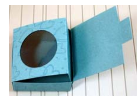
Step 12: Remove the covering from the adhesive

and assemble the bottom of the box. Bend the card stock inwards along score lines. Tuck in the circular window piece. Close the lid of the box by slipping the tab into the slot. Embellish as you wish.