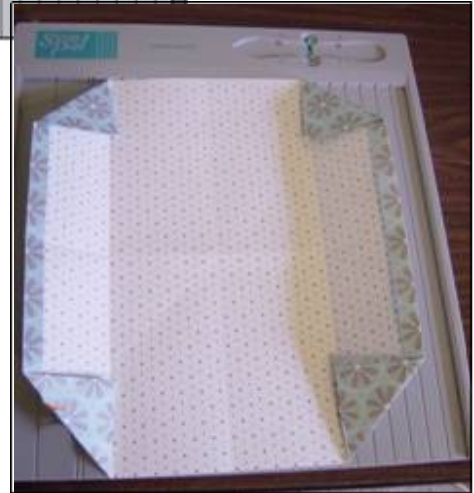
Step 4: Fold all the edges of the cardstock to the nearest score line forming 4 small triangles. Crease well with the Scor-Tool™