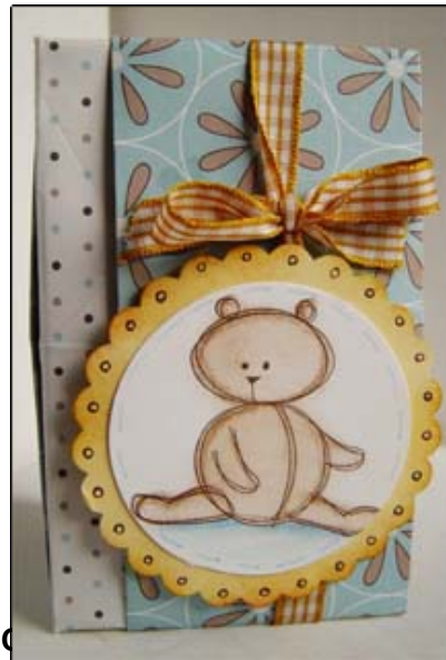
Viola! Criss C Embellish with, stamps, chipboard, file folders, pictures, gift cards, and any other mementos.