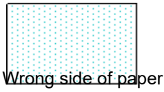
Wrong side of paper