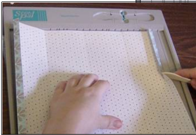
Step 3: Turn in the 1/2" scores. Crease well with the Scor-Tool™