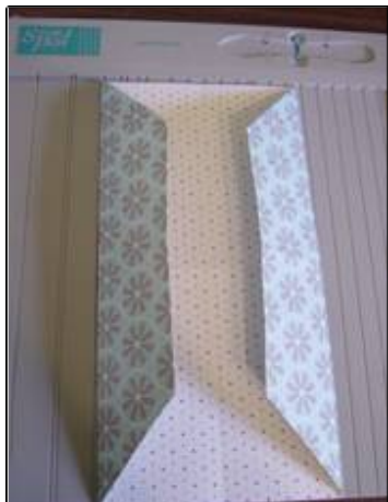
Step 5: Fold in the two outer edges. Crease well with the Scor-Tool™